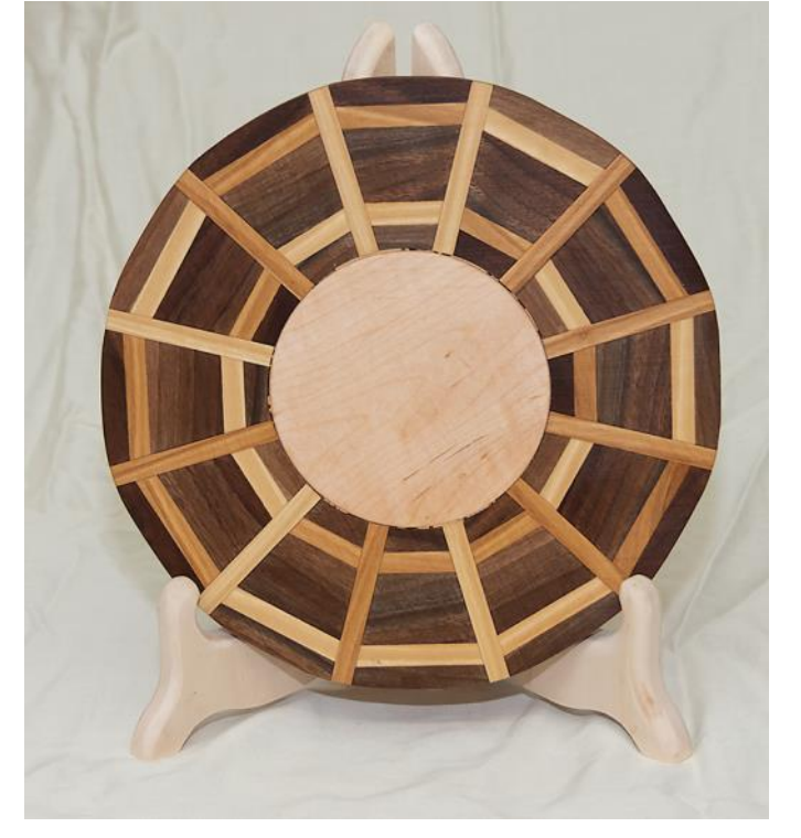
Larry Gritton-Various woods-Oil-S&T