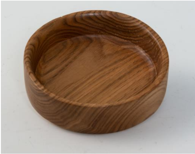
Lyle Hansen-First Bowl-S&T