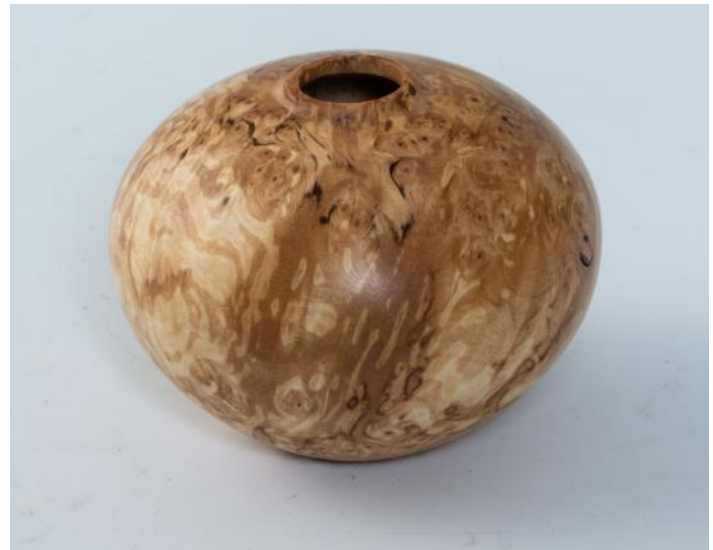
Brad Davis-Big leaf Maple-Wiping varnish-S&T