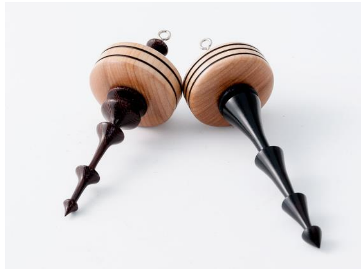
Tim Wehr-Maple & Ebony, Maple & Co- cobolo-OB Shine Juice-POM