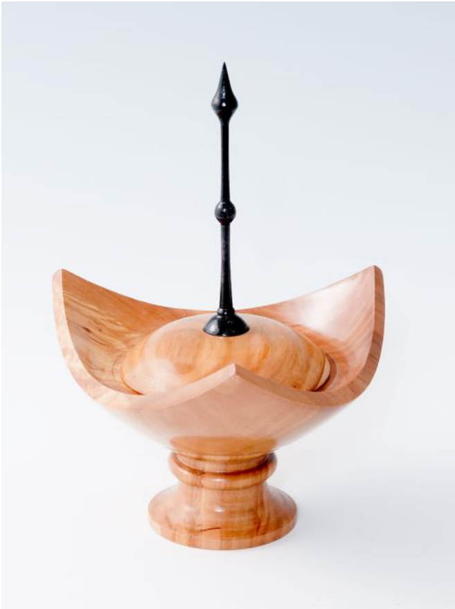
Tom Nehl-Apple-Sanding Sealer-S&T