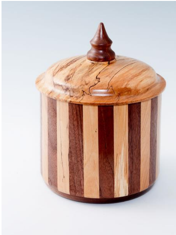
Jim West-Spalted Maple & Walnut- WOP-S&T