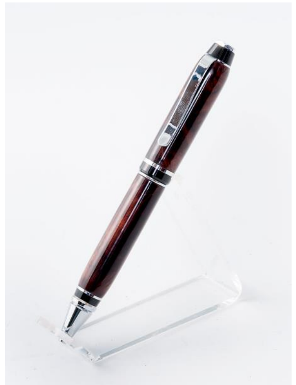
Tim Wehr-Walnut Burl-CA-S&T