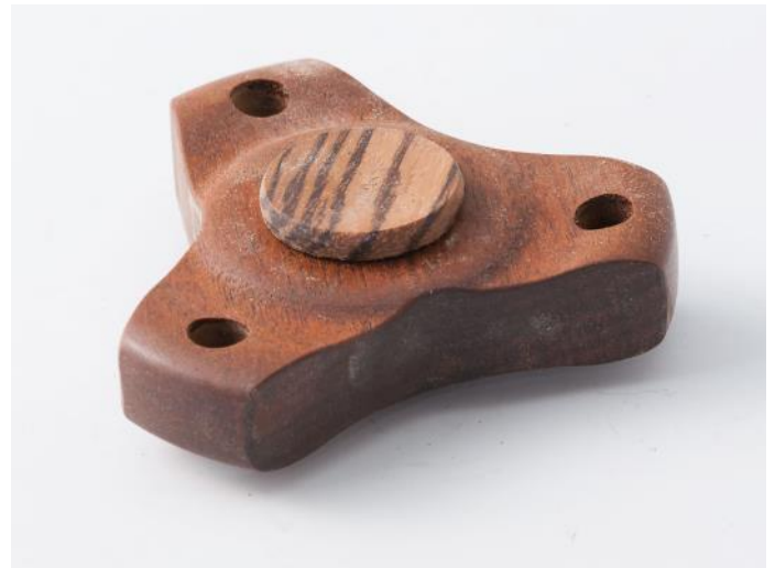
Tom Mills-Ipe & Zebrawood-SB-POM