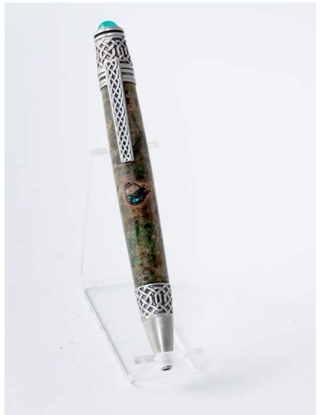
Tom Nehl-Cherry Burl-CA with mother of pearl filler-S&T