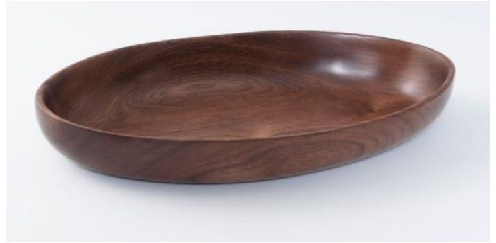
Paul Rohrbacher-Walnut -Tung Oil-S&T