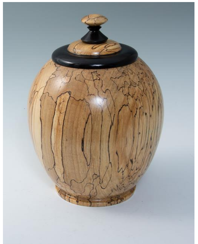
Harold Rosauer-Spalted Maple-Poly-POM