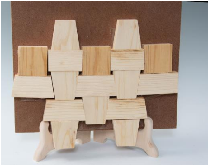
Don Coleman-Pattern example