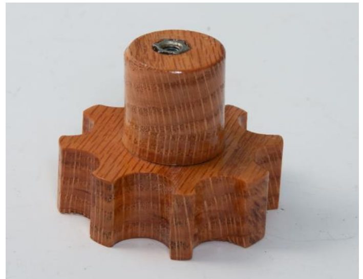
Jim Clauson-Red Oak-Poly-POM