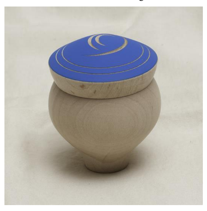
Greg Ellyson-Maple- Wax-POM