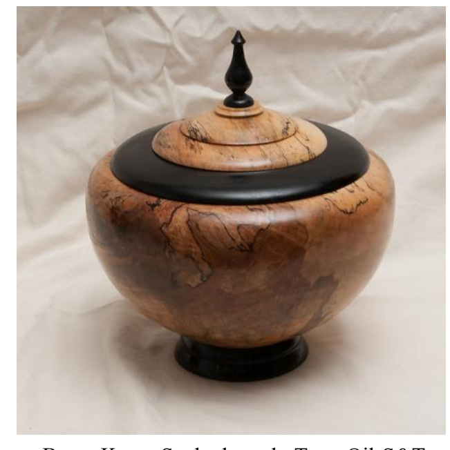
Bruce Kruse-Spalted maple-Tung Oil-S&T