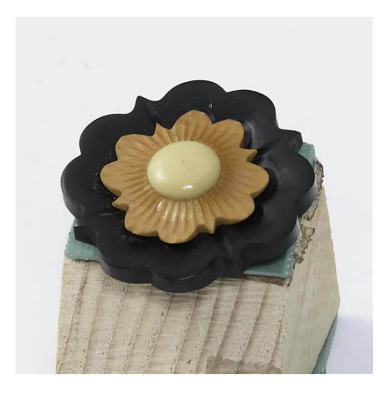
Brad Davis-Blackwood, Boxwood & Tagua Nut {\rm S\&T}