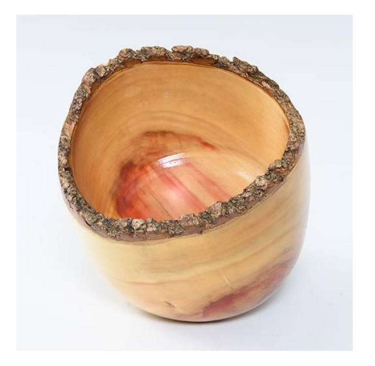
Gary Nosek-Boxelder-Spar Urethane-S&T