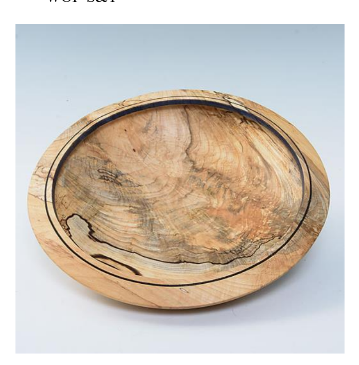
Brian Nowak-Thompson-Maple-Osmo hard wax oil-S&T