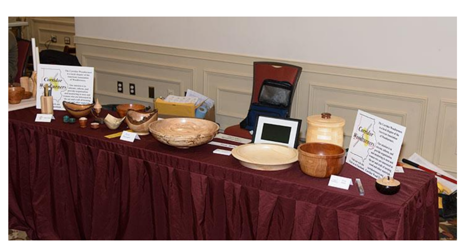
Club member projects on the club table at the Carving and Turning Show