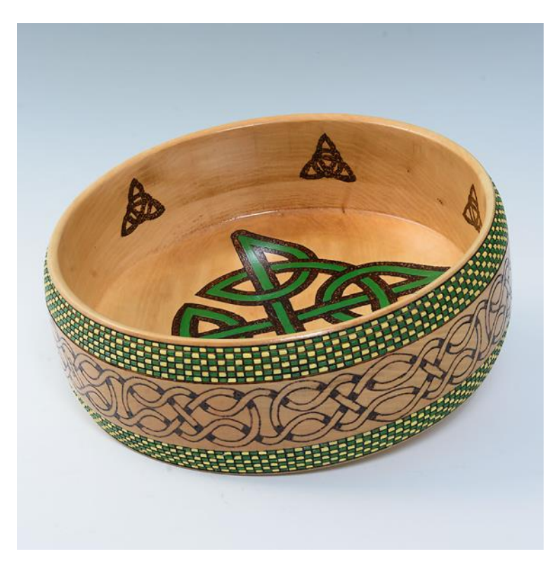
M E M B E R S