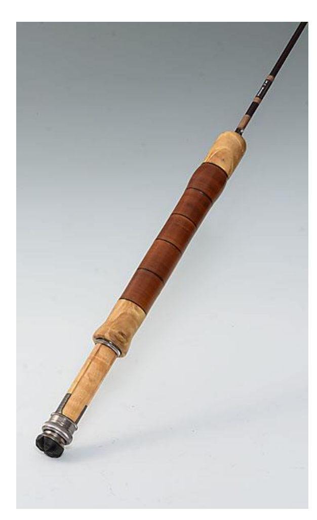
Doug Nauman-Cottonwood bark & Stabilized Maple Burl-/Ebony seat— WOP-S&T