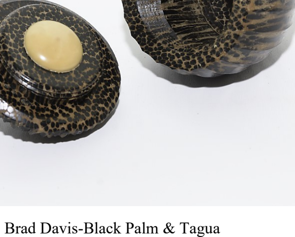
Nut-Oil & lacquer