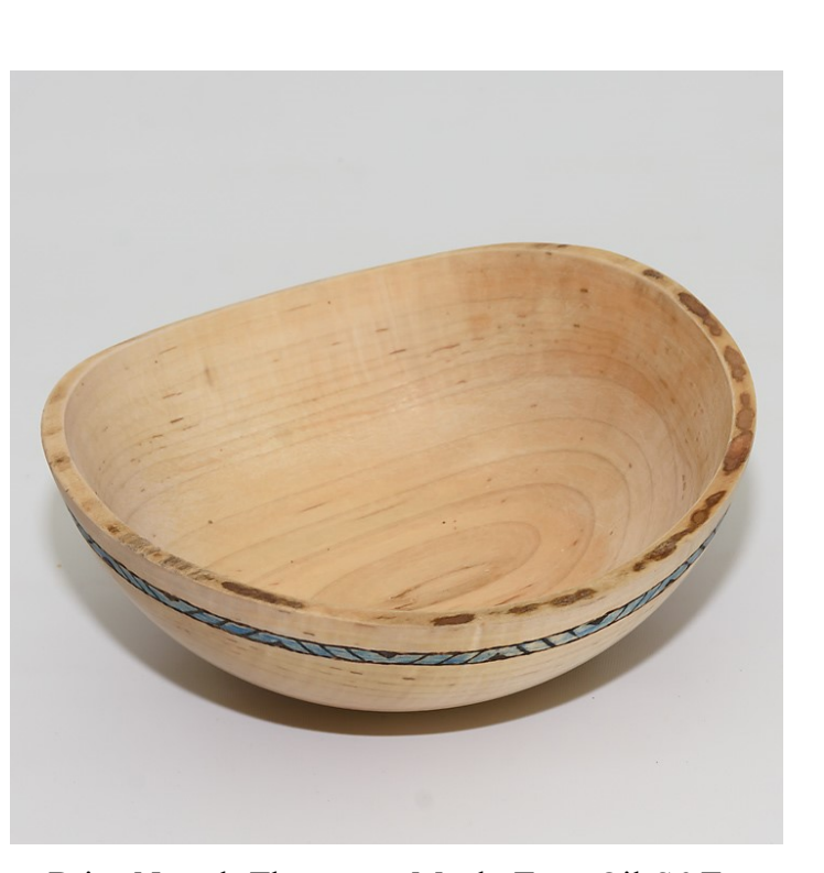
Brian Nowak-Thompson-Maple-Tung Oil-S&T