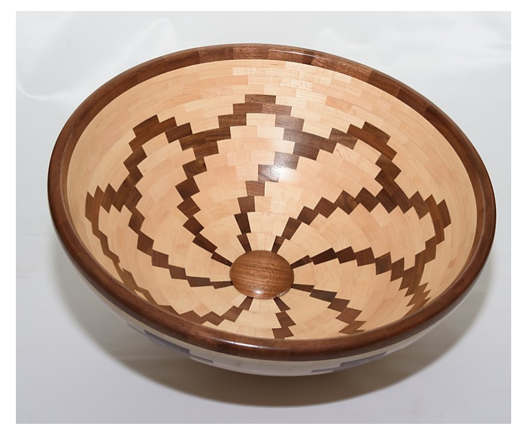
Neal Olson-Walnut & Maple-S&T