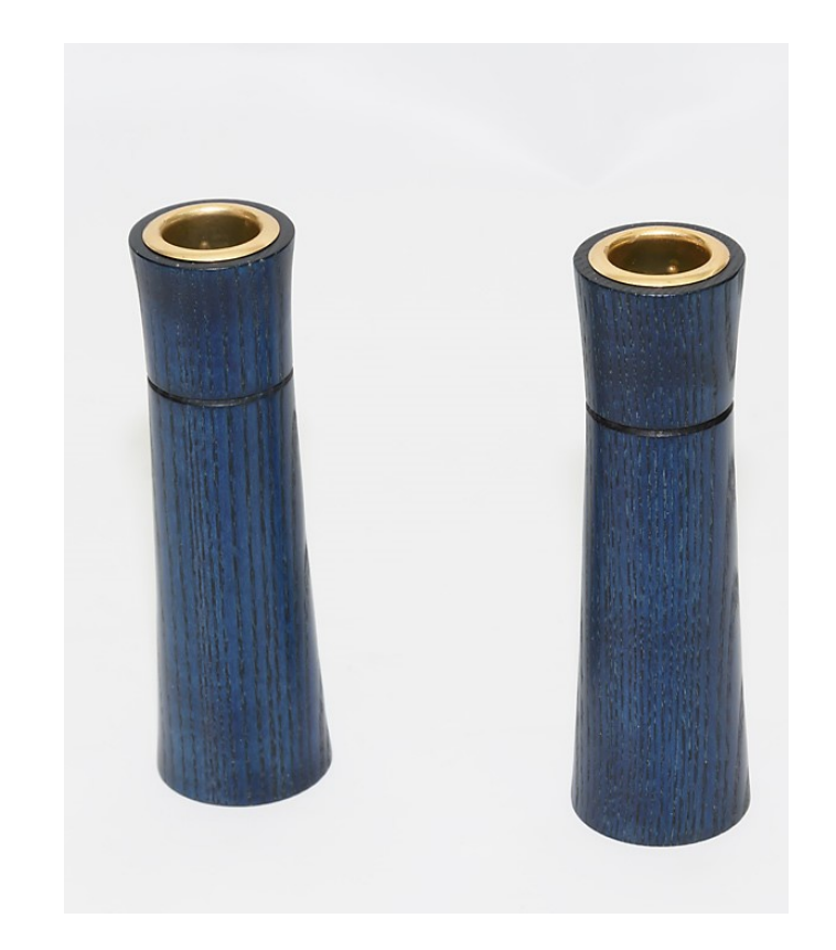
Brian Nowak-Thompson-Ash-Blue dye & Poly S&T