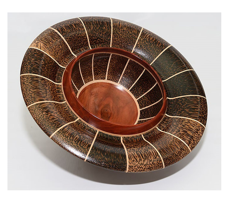
Neal Olson-Black Palm & Red Heart-S&T