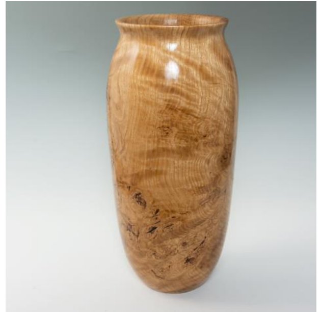
Tom Nehl-White Oak Burl-WOP-POM