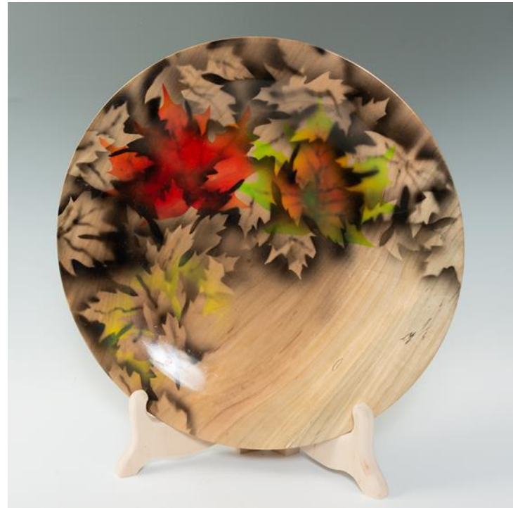
Stacy Nehl-Cottonwood-Acrylic paint & Poly-POM