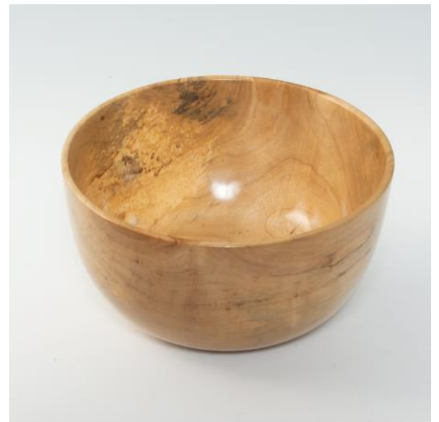
Tom Nehl-Soft Maple-WOP-POM