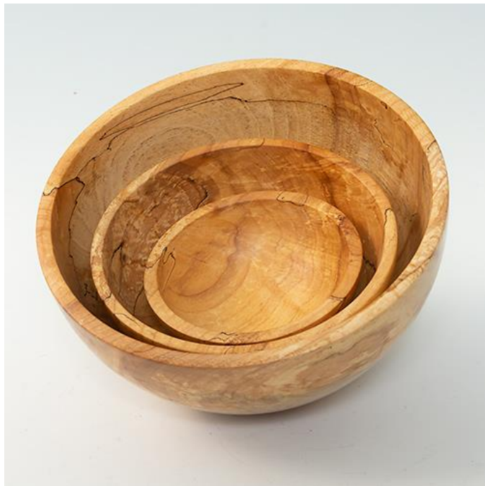
Brad Davis-Spalted maple-Watco-S&T