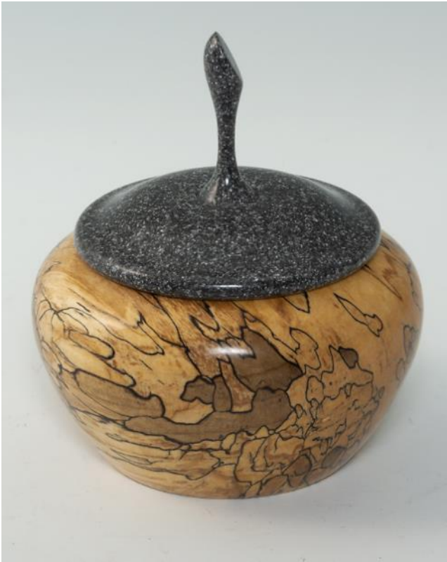
Tim Wehr-Stab spalted soft maple- OB Shine juice-POM