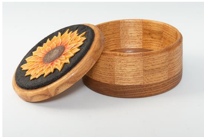
Stacy Nehl-Oak & Basswood-Poly-S&T