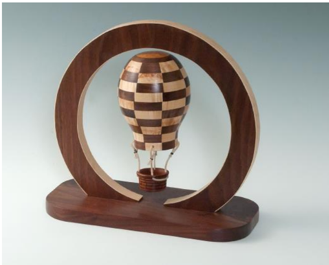
Kevin Bierman-Walnut & Maple-Antique Oil-