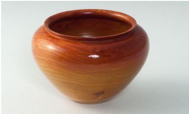
Stacy Nehl-Cherry-Dye & Poly-S&T