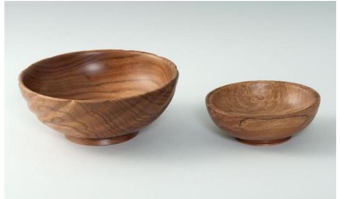
Bruce Kruse-Sycamore & Butternut-Krylon-S&T