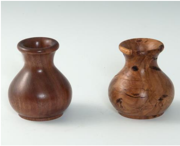
Kevin Bierman- Walnut & Oak-Antique Oil-POM