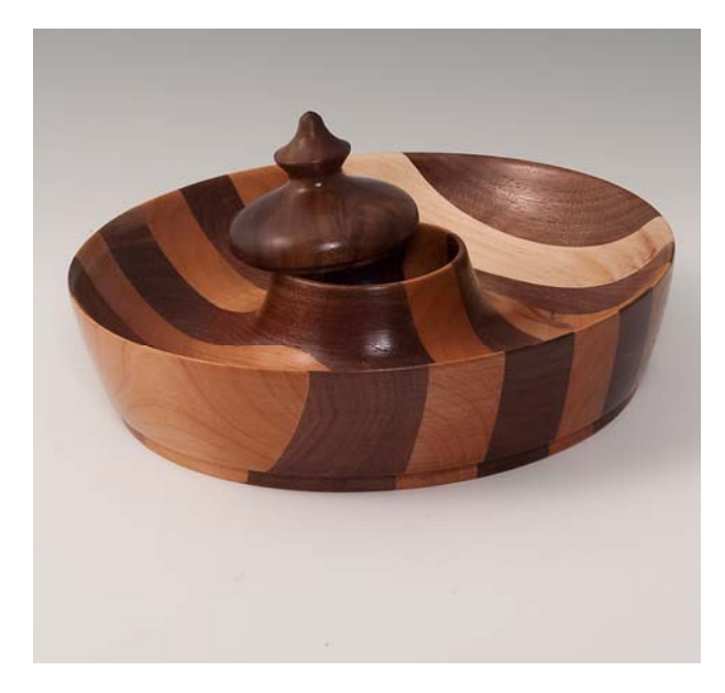
Jim Colbert-Walnut, Cherry, Maple-Salad Bowl-S&T