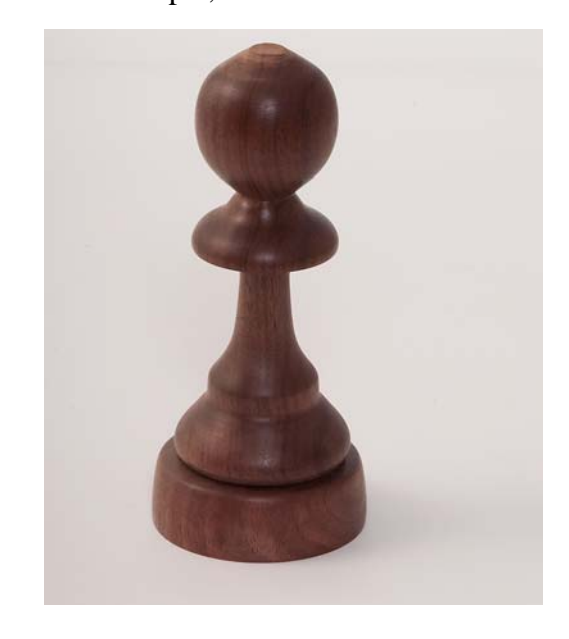
Joannie West-Walnut-in progress