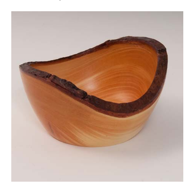
Ron Luckeroth-Antique Oil- POM