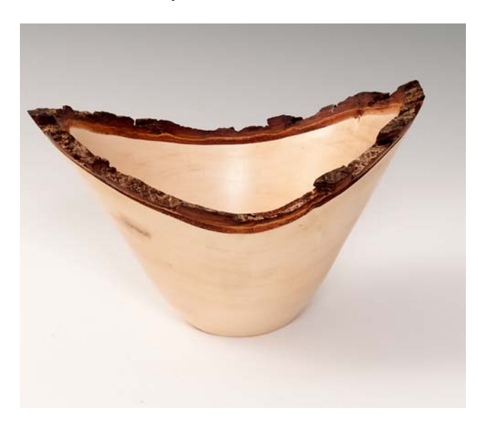
Kevin Bierman-Buckeye-Antique oil-POM