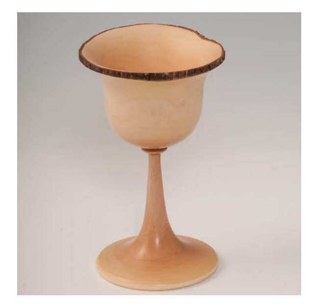
Greg Ellyson-Iron wood-Oil-POM