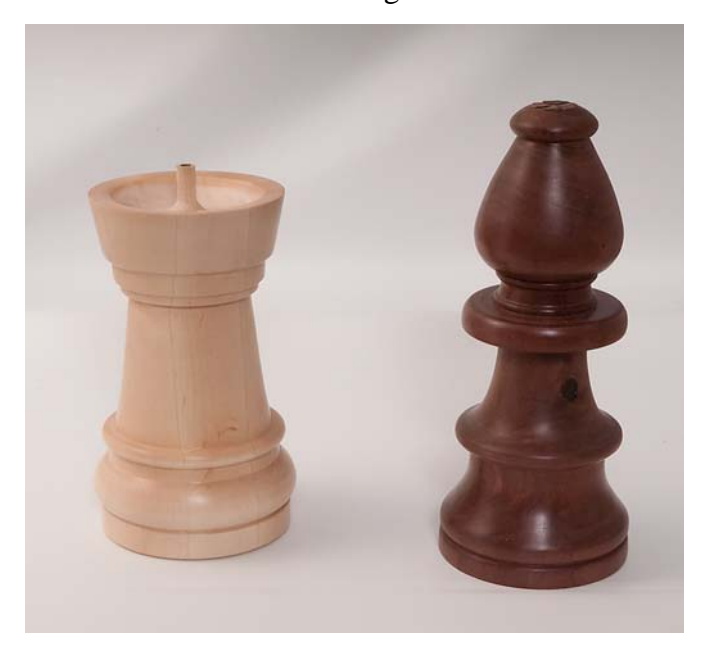
Jim West-Maple, Walnut-bees wax-S&T