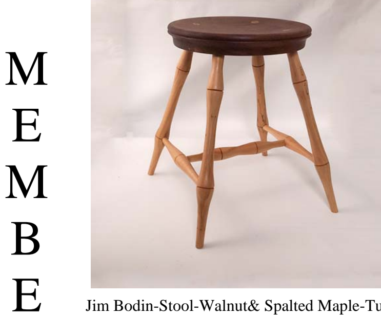
Jim Bodin-Stool-Walnut& Spalted Maple-Tung Oil