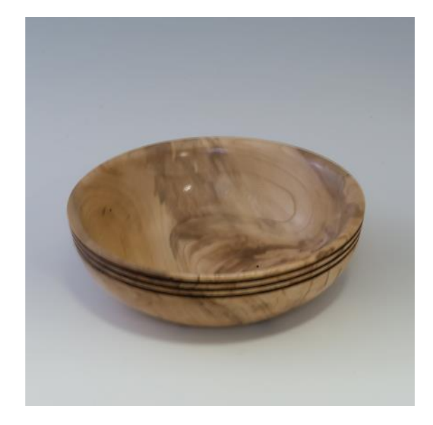
Brandan Westmark-Grey Elm-Poly-S&T