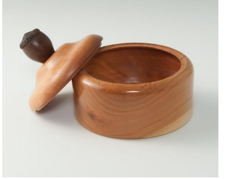
Stacy Nehl-Cherry-Salad Bowl-POM