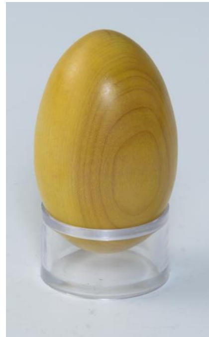
Bruce Kruse-Maple-AO-POM a month early