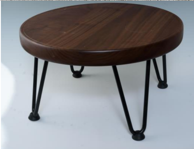
Bruce Kruse-Walnut-1311 Krylon-S&T