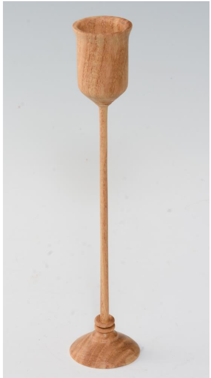
Tom Nehl-Honey locust -WOP-POM