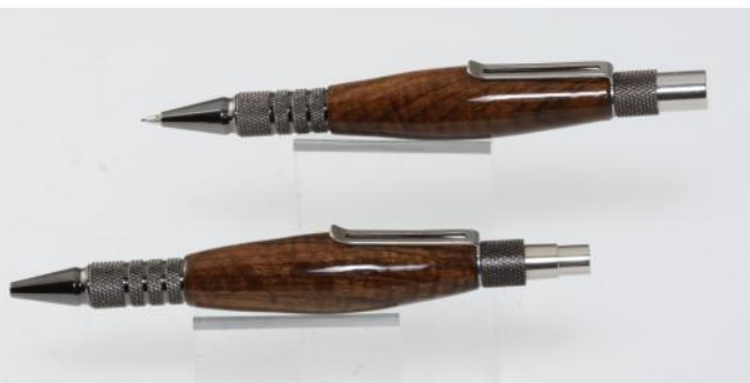
Rod Nabholz-Turkish walnut-CA-S&T