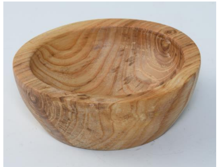
Everett Collins-Ash-Tung Oil-S&T