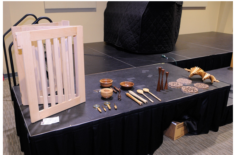
Some of the show and tell items