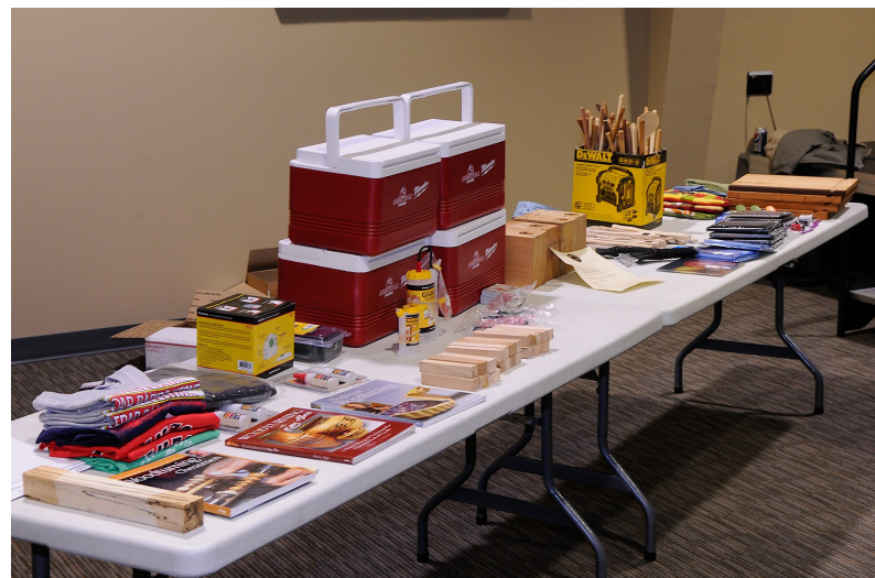
A table full of door prizes