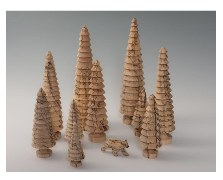
Harold Rosauer-Spalted Basswood-None-S&T