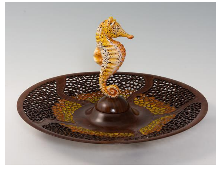
Stacy Nehl-Walnut & Basswood-S&T