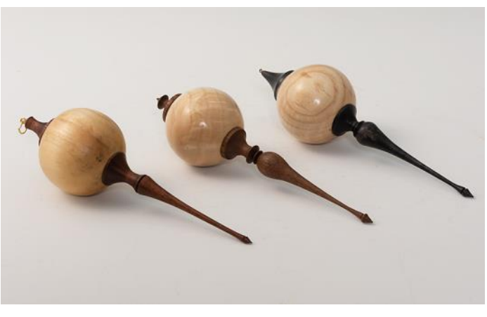
Jim Bodin-Maple & Walnut-Wax-POM