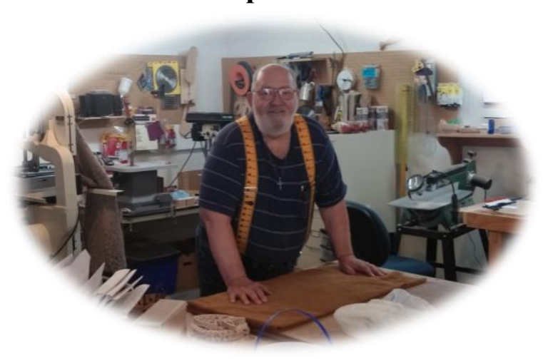
The help corner will be back next month.