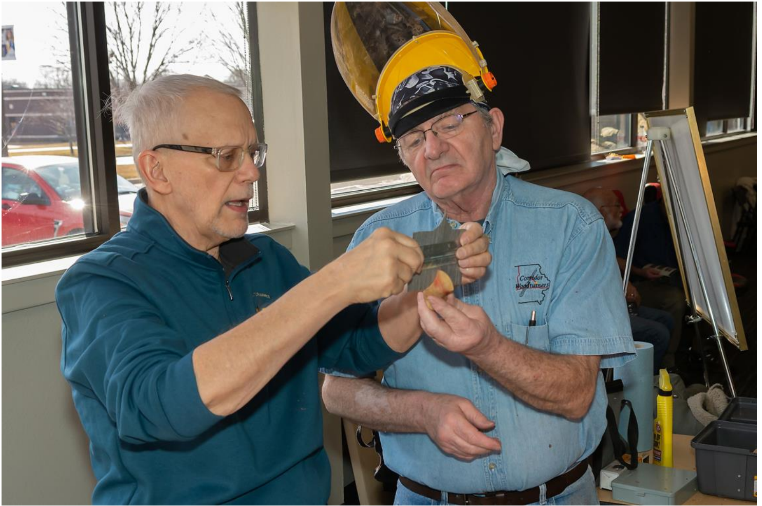
The two Tom's check the procedure for determining the shape of the femisphere