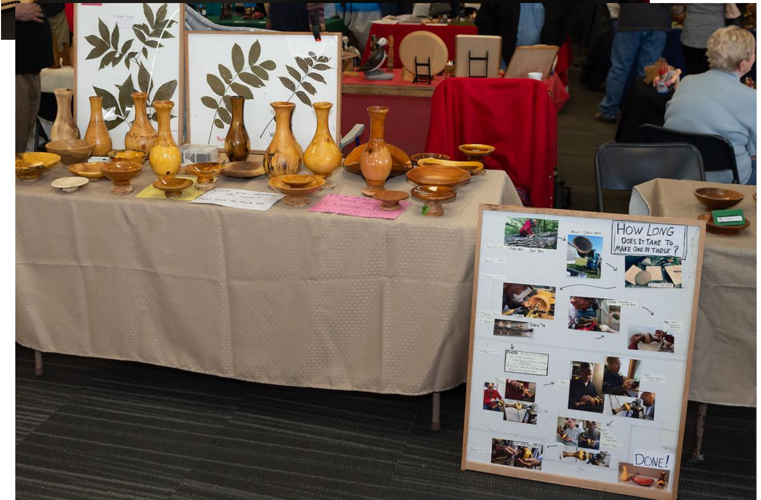
Below. A view of Ray Hamilton's display table