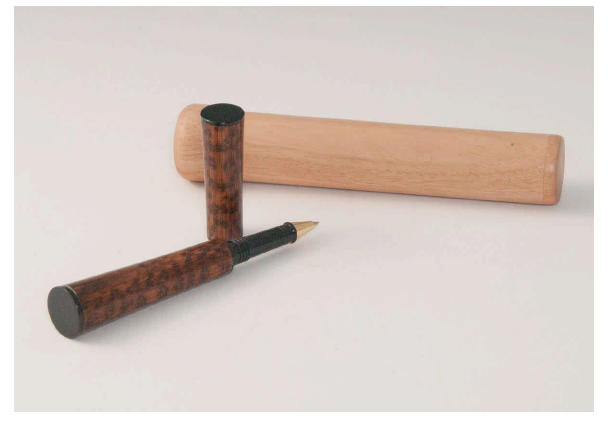
Tom Mills-Snake wood & Eucalyptus-Lacquer & CA- S&T