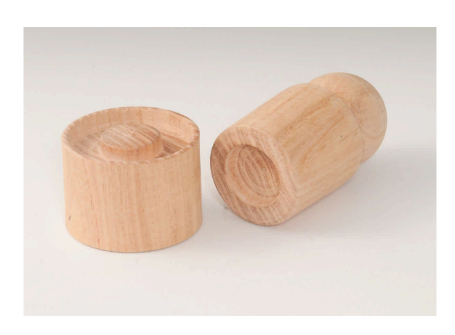
Jim Bodin-Honey Locust- POM