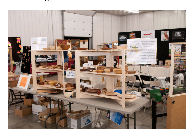
Never lose sight of the customer/user. Anything that is intended to be used must be usable.

As in years past there were those who inquired about the club and what we do, so there should be some new faces at our meetings in the future.