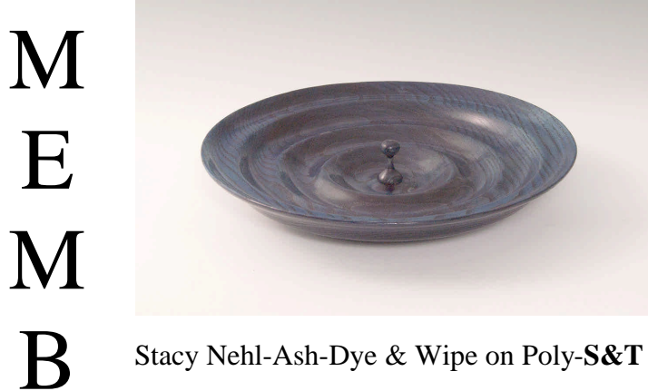
Stacy Nehl-Ash-Dye & Wipe on Poly-S&T