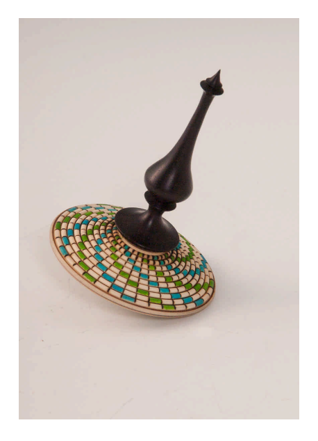
Greg Ellyson-Holly & African Blackwood– Lacquer and wax S&T