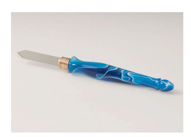
Greg Ellyson-Acrylic-Wax- POM