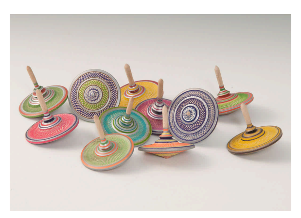
Greg Ellyson-Maple-ink markers-S&T