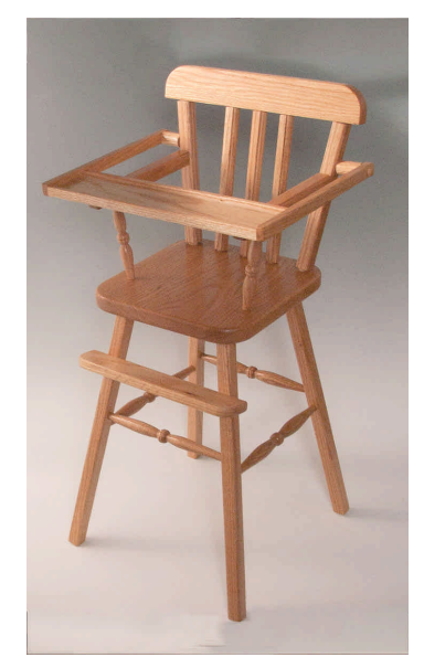
Kevin Bierman- POM