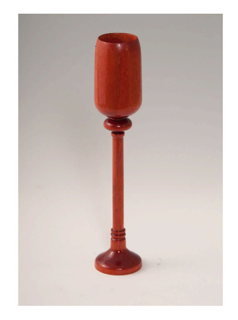
Tom Nehl-Spanish Cedar-Dye & Wipe on Poly- POM