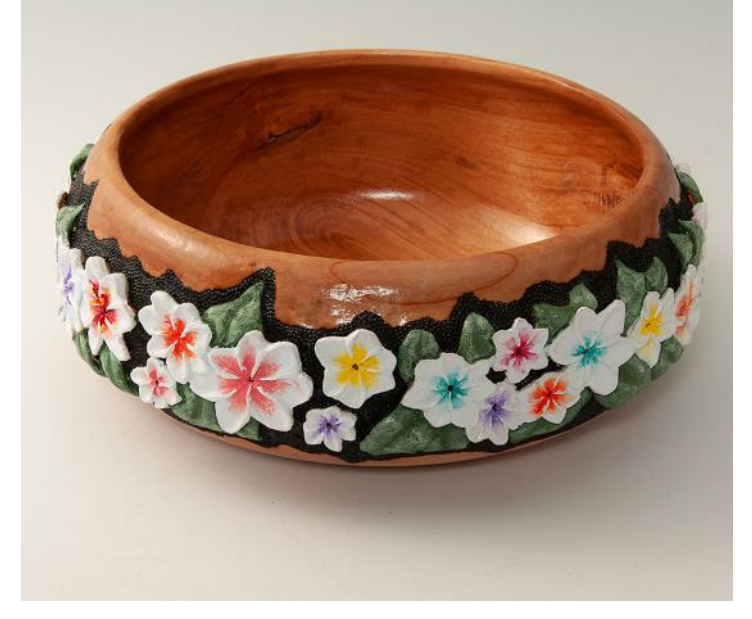
Stacy Nehl-Cottonwood-Stain, Paint, Pyro, Spar Varnish-S&T