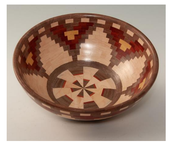
Don Coleman-Maple, Bloodwood, Yellow Heart, Walnut-WOP-S&T