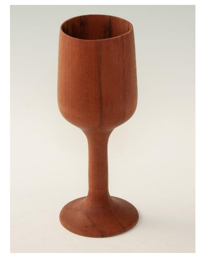
Tom Osborne-Redwood-Cutting board sealer-S&T