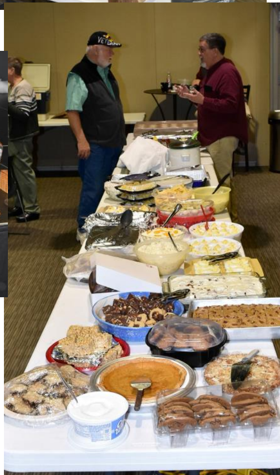
Christmas party photos

Name - Wood - Finish - Category Legend: AO=Antique Oil WOP=Wipe on Poly POM=Project of the month S&T=show and tell BLO= Boiled Linseed Oil SB= Salad Bowl finish FOG=Found on Ground