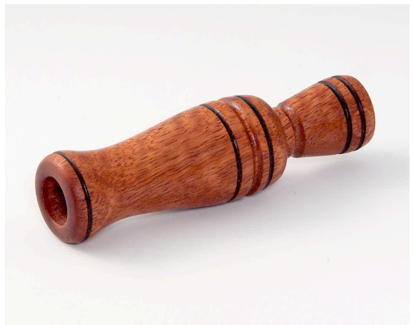
Jim Bodin-Wood?-Tung oil-POM