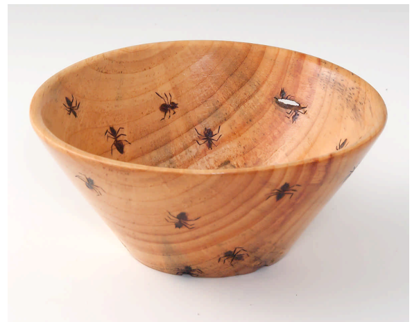
Stacy Nehl-Pine-Wipe on poly-POM