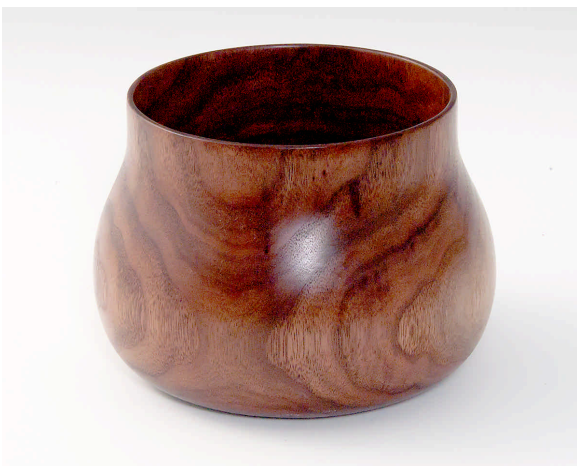
Jim Bodin-Walnut-Tung Oil -S&T