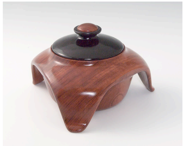
Tom Nehl-Bubinga & Maple-dye & WOP-POM