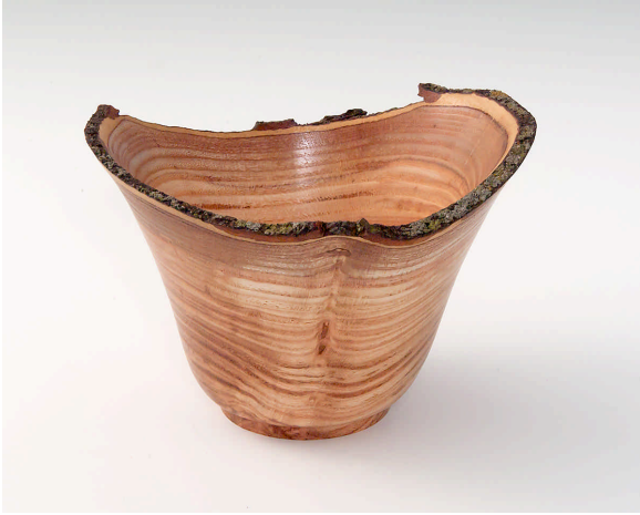
Kevin Bierman-Locust-Antique oil-POM