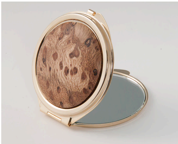
Jim West-Pin Oak-POM