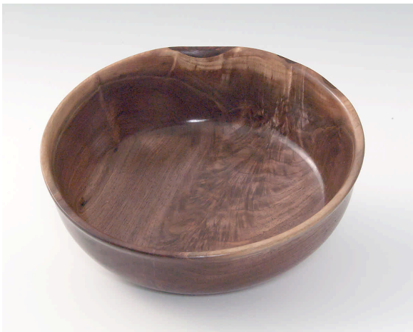
Tom Nehl-Walnut-Wipe on poly-S&T