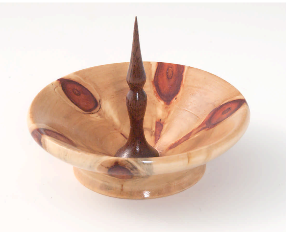
Bob Ristow-Norfolk Island Pine &Walnut- Wipe on poly-S&T