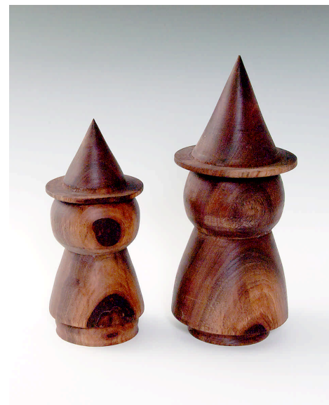
Jeremy Hansen-Walnut-Vegetable Oil-POM