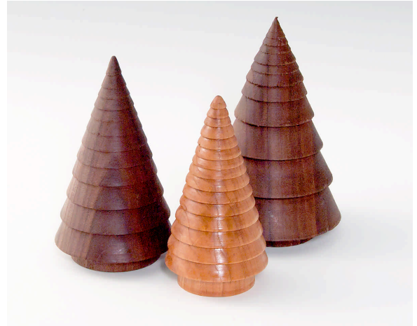
Kris Hansen-Walnut & Cherry- Vegetable oil-POM