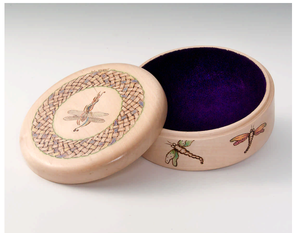
Stacy Nehl-Basswood-Wipe on Poly-S&T