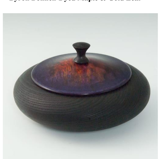
Byron Bohnen—Ash & Maple –Burnt & Dyed