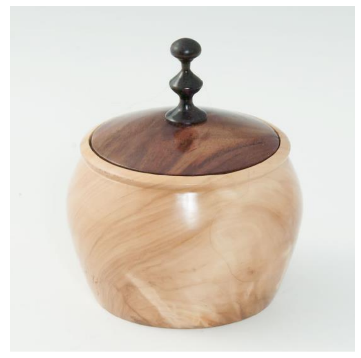
David Tegeler-Maple & Walnut