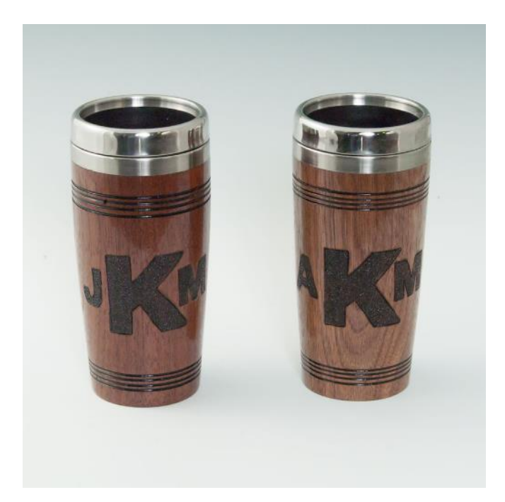
Don Potter-Walnut-Wipe on Poly