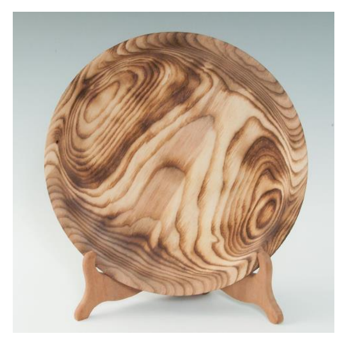
Jim West-Black Ash-Bees Wax