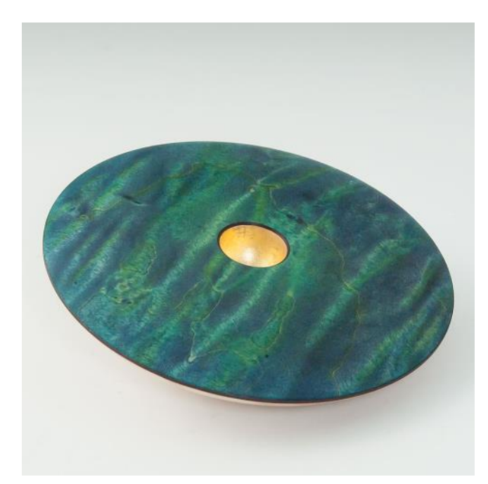
Byron Bohnen-Dyed Maple & Gold Leaf