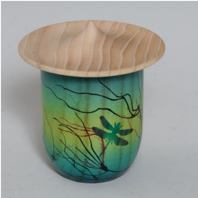
Greg Ellyson-Ash-Dye & Wax-S&T