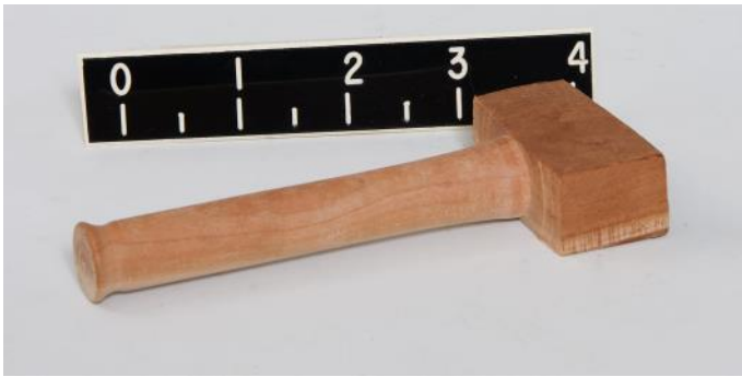
Emily van den Hoeven-?-None-POM