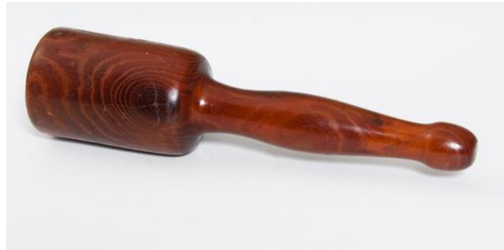
Doug Nauman-Osage orange-WOP-POM