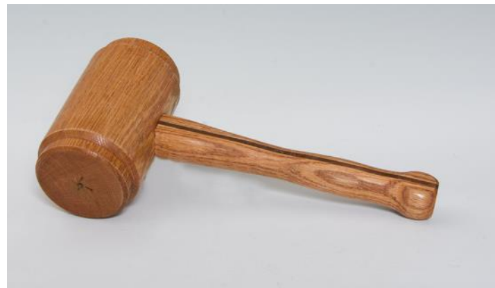
Tom St John-W&R Oak & Walnut-AO-POM

Name -Wood - Finish - Category Legend: AO=Antique Oil WOP=Wipe on Poly POM=Project of the month S&T=show and tell BLO= Boiled Linseed Oil SB= Salad Bowl finish FOG=Found on Ground