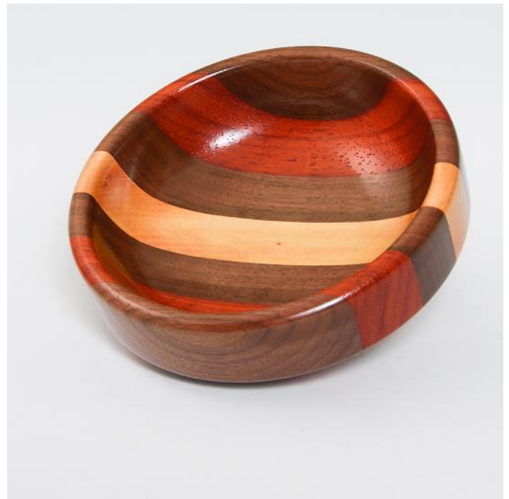
Rod Nabholz-Padauk-Yellowheart-Walnut WOP_S&T