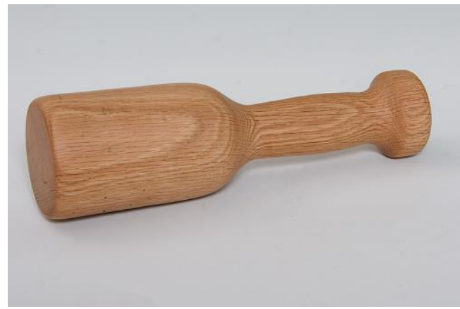
Rod Nabholz-White Oak-Bee's Wax-POM