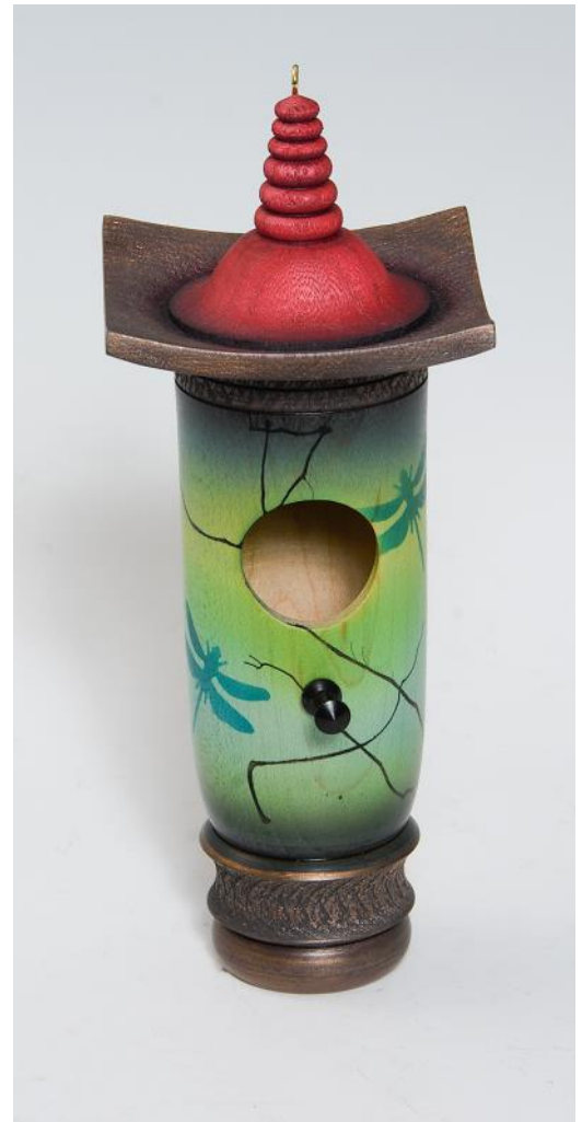
Greg Ellyson-Maple-Hye & Wax-S&T