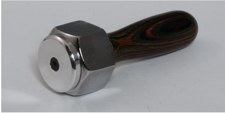
Greg Ellyson-Dymond Wood-Wax-POM