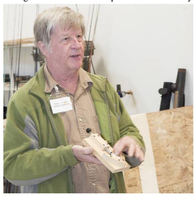
found out that there is a good deal of time and effort that go into making the difference between a professionally made fly rod and an off the rack "fishing pole". Good job by all.

around several plain handles and rods with handles made of differing materials and combinations of materials to stress this point. They showed many jigs and special tools, some purchased and some home made, to help the construction and alignment of the various parts of a rod. Many of us