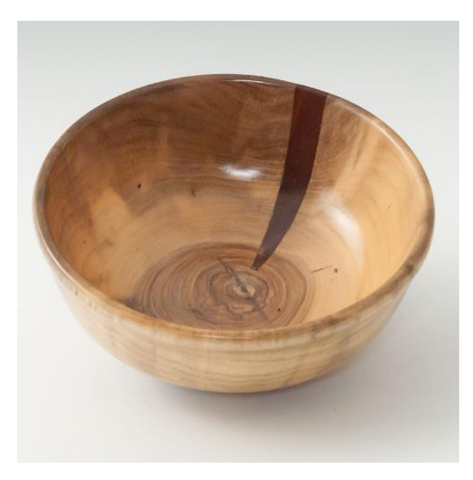
Tom Nehl-hackberry with Walnut-WOP