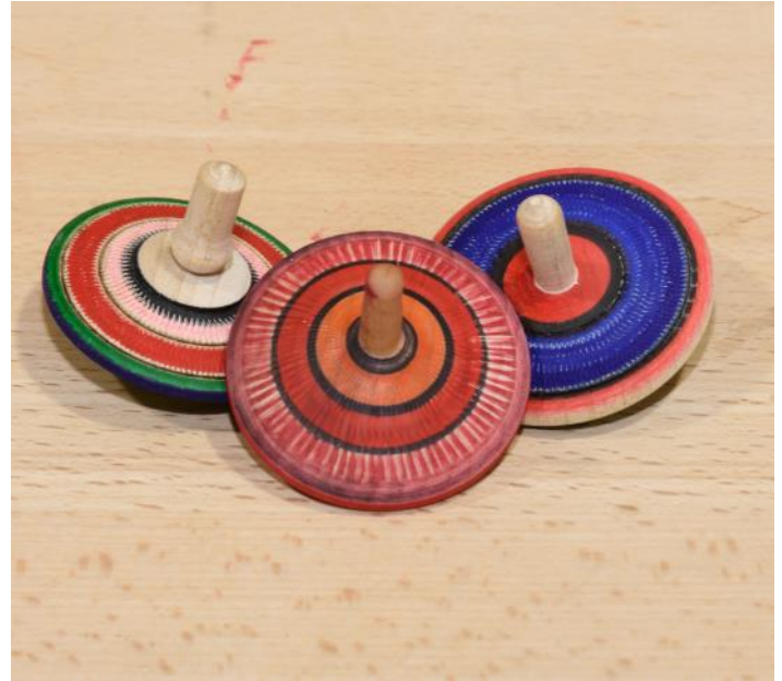
Bruce Kruse- Hard Maple- POM