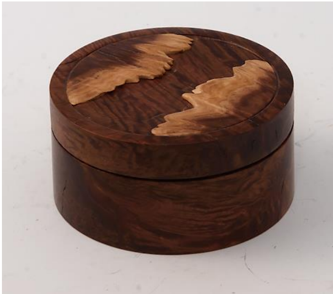
Brad Davis-Aussie Burl-Acrylic-POM