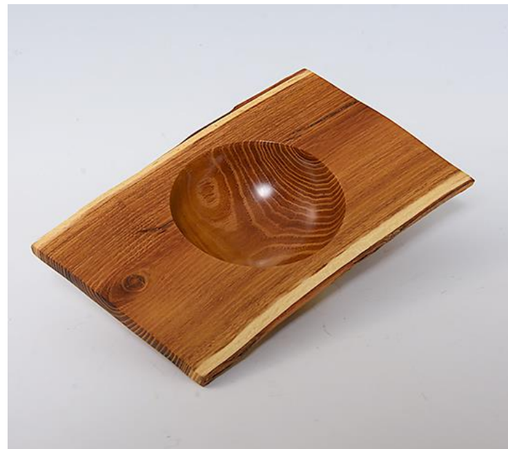
Greg Ellyson-Osage Orange-Oil-S&T