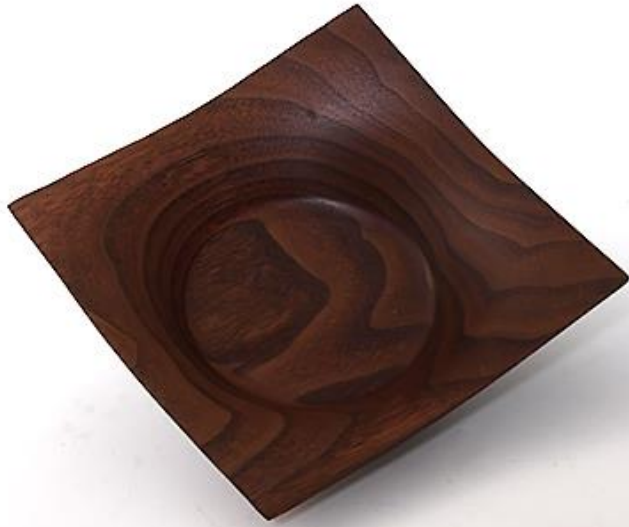
Toby Hyde– Walnut-Danish oil– S&T