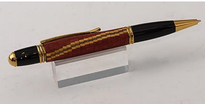
Don Coleman-Bloodwood &amp; Yellowheart-water based poly-S&amp;T