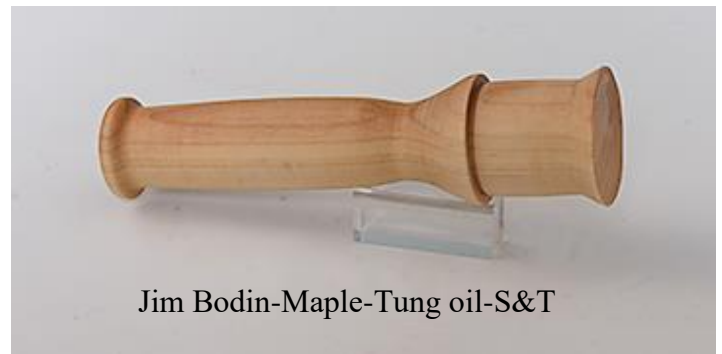
Jim Bodin-Maple-Tung oil-S&amp;T