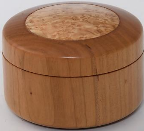
Greg Ellyson-Cherry & Black Ash-Oil-POM