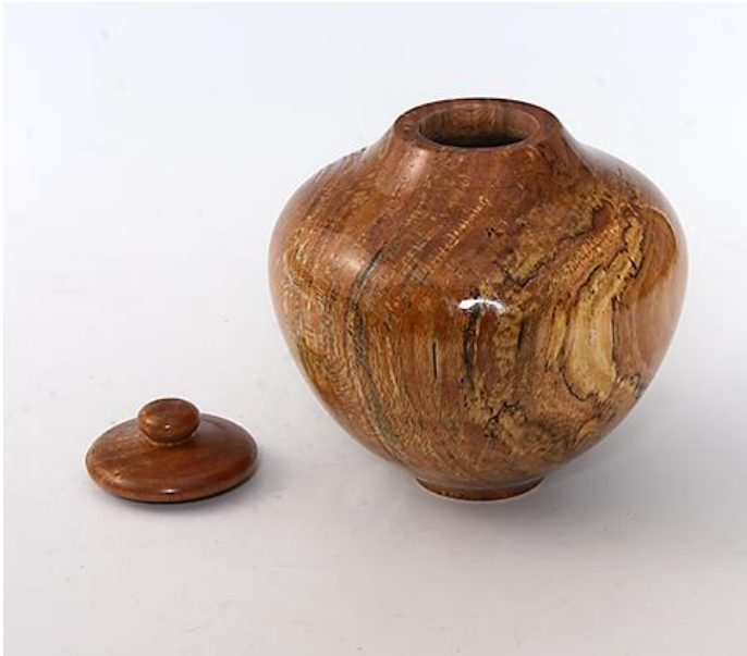
Amanda Felts-&amp; Greg -Chestnut-Tung oil-S&amp;T