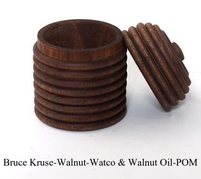
Bruce Kruse-Walnut-Watco & Walnut Oil-POM