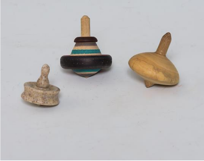
Doug Nauman-Maple, Spalted Maple, Acrylic- WOP-POM