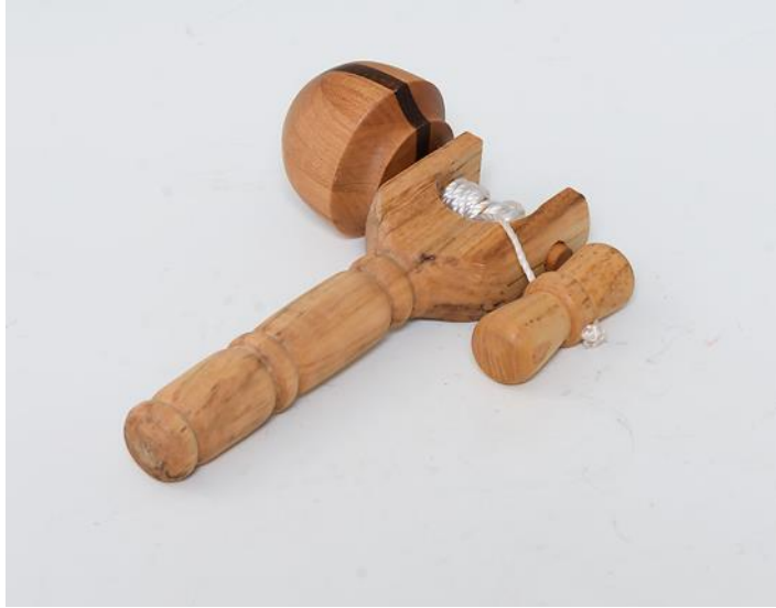
Harvey Jeck-Spalted Maple, Maple, Walnut-Oil -POM