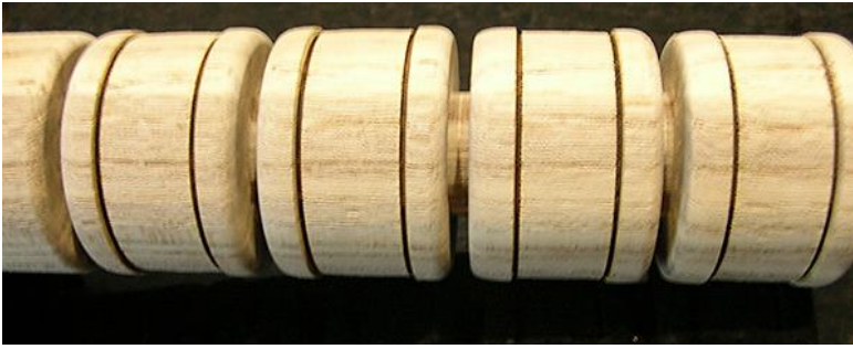
Rings ready for embellishing

Making the wall any thinner will make the "Ring" more prone to crushing or breaking. Carefully part or separate the individual "Rings" and sand the inside of the "Ring" using either a sanding cylinder or an oscillating Spindle sander. Use a jam chuck to finish each end of the "Ring". The jam chuck should be as shallow as possible to allow for finishing each end of the "Ring".